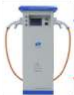
Charging Station 22 kW