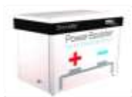
Battery ADS Tech 28 kWh