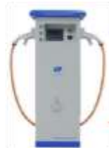
Charging Station 22 kW